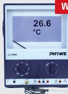
ADM 3 front with attached temperature sensor