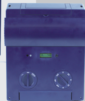
Easy operation also from the back