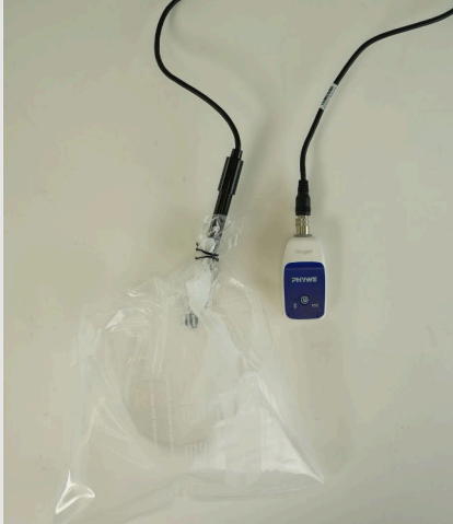
Setup for collecting the breathing air