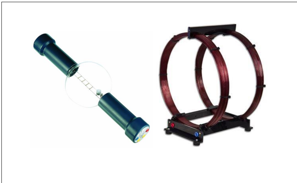
Fig. 1: 06959-00 Narrow-beam tube 06959-00 and a pair of Helmholtz coils 06960-06