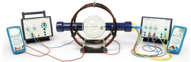
Fig. 3: Experimental setup for determining e/m with the narrow beam tube P2510200.

This presumes that the current I in both coils is identical. 1.256 \cdot 10^{-6} \text{ T m/A} is to be taken as the value of \mu_0 .