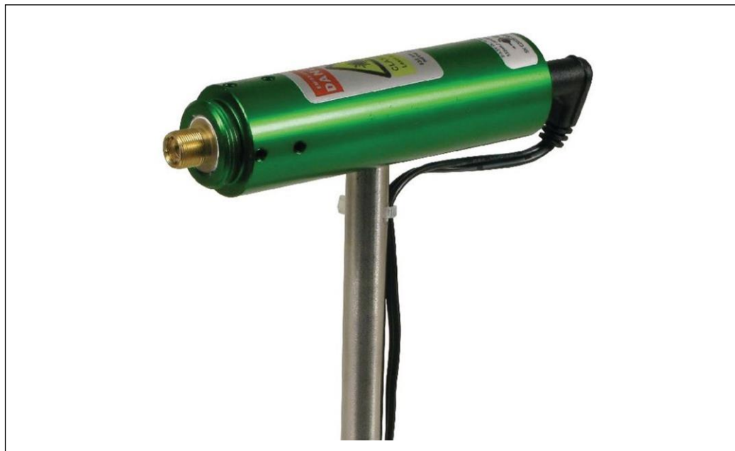
Fig. 1: Diodelaser, 1 mW, 532 nm (green) with short stem 08764-99