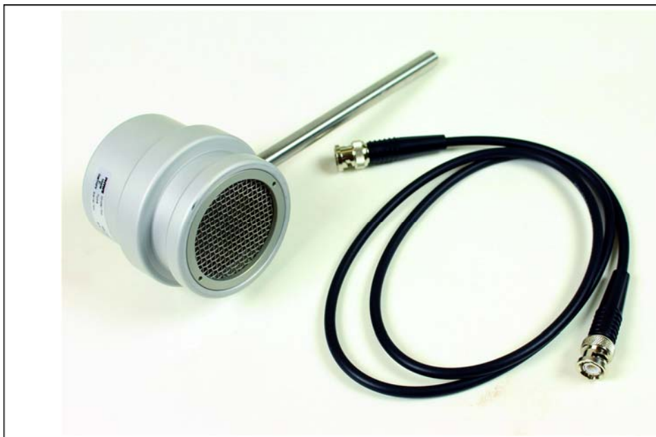
Fig. 1: Geiger-Muller counter tube, 45 mm 09007-01

The unit complies with the applicable EC guidelines