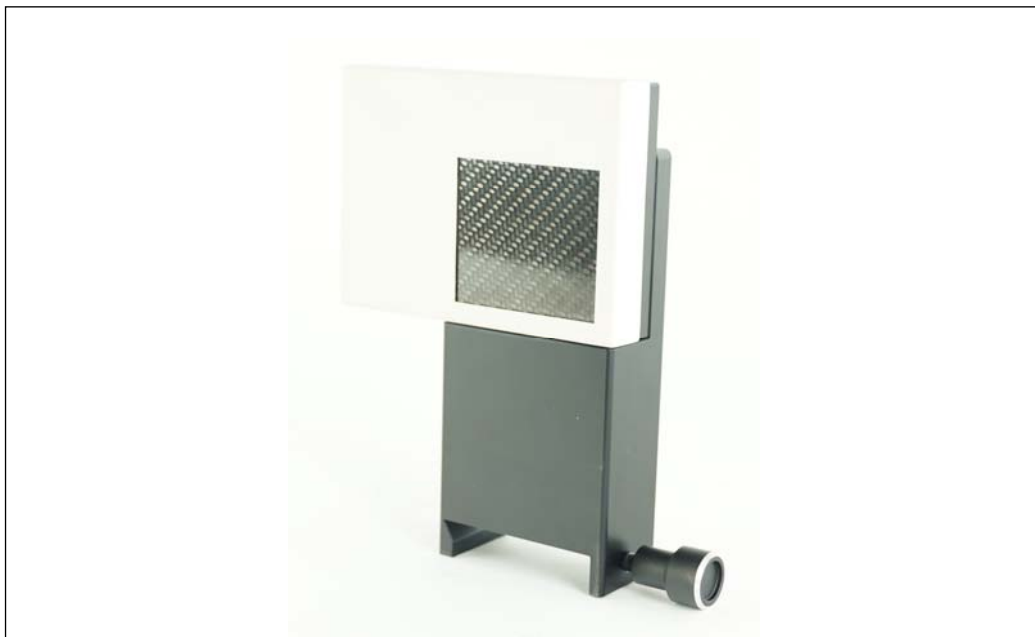
Fig. 1: 09057-41 XR 4.0 X-ray Direct Digital Image Sensor II (XRIS II)

PHYWE Systeme GmbH & Co. KG Robert-Bosch-Breite 10 37079 Göttingen Germany Tel. +49 (0) 551 604-0 Fax +49 (0) 551 604-107 E-mail info@phywe.de