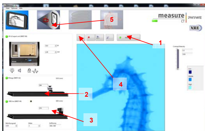
Fig. 2: Screenshot in "Live Image and Settings" mode

Check the positioning of your specimen and, as soon as you want to start a scan, click on the next status "CT scan" (5).