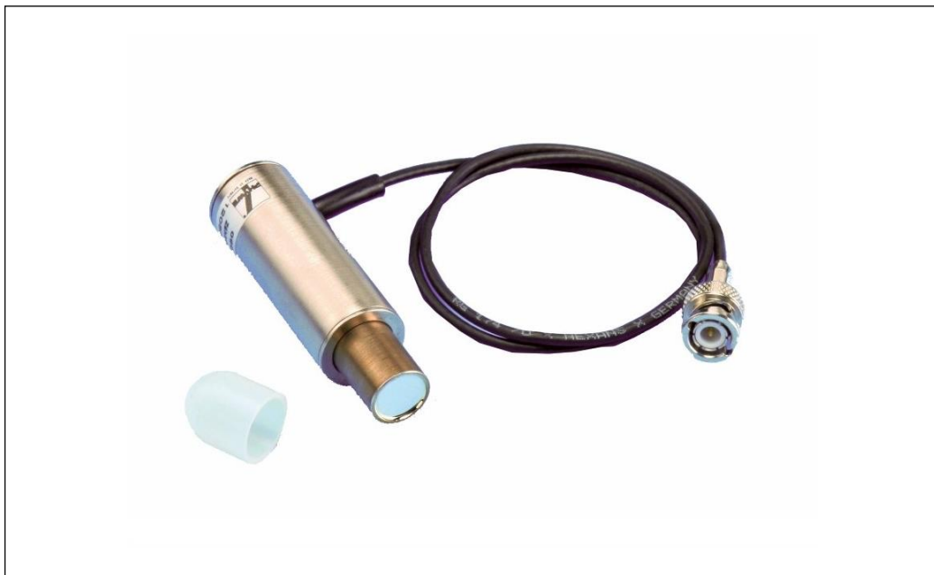
Fig. 1: 09005-00 Counting Tube, Type B

The unit complies with the applicable EU-guidelines