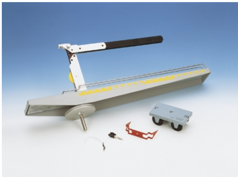
Fig. 1: Centrifugal force apparatus with cart 11008-88

The unit complies with the correspond- ing EC guidelines.