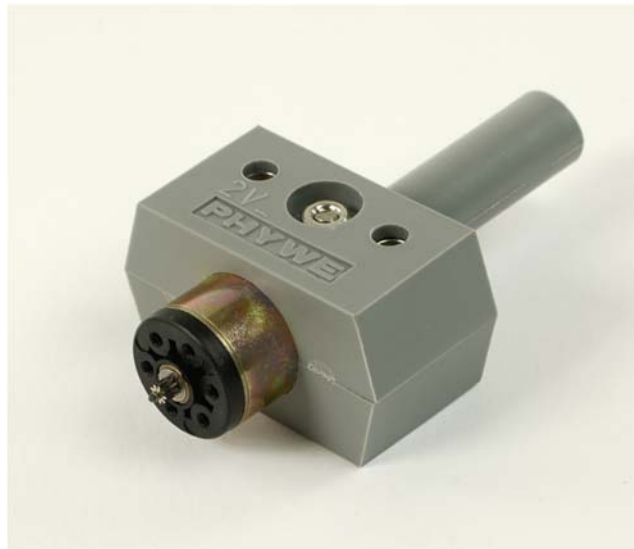
Fig. 1: Motor 2 V DC, 11031-00