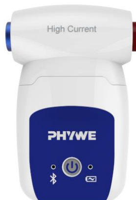
Fig. 1: 12925-00 Cobra SMARTsense High Current \pm 10 A