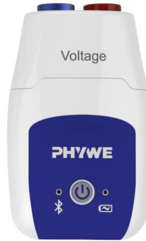
Fig. 1: 12901-01 Cobra SMARTsense Voltage \pm 30V

The unit complies with the applicable EC-guidelines