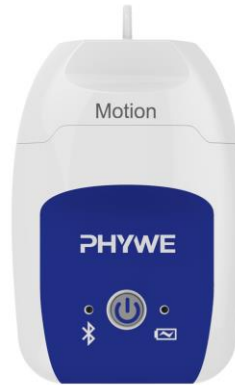
Fig. 1: 12908-02 Cobra SMARTsense Motion