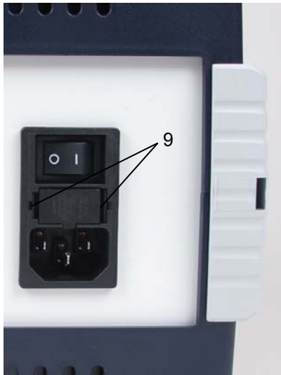
Fig. 2: Fuse holder

The fuse holder (Fig. 2) in the upper part of the device connector at the back can be accessed once the mains power connecting cable has been removed. It can then be pried out with the aid of a screwdriver.