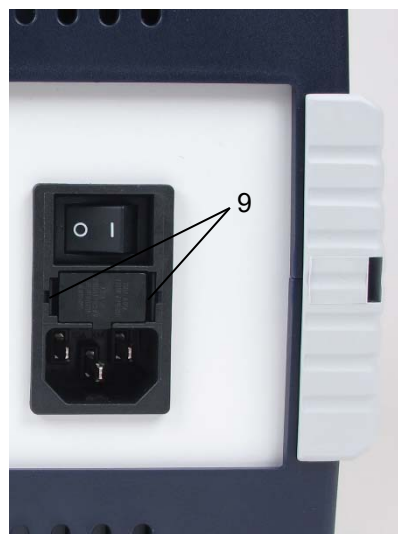
Fig. 2: Fuse holder

The fuse holder (Fig. 2) in the upper part of the device connector at the back can be accessed once the mains power connecting cable has been removed. It can then be pried out with the aid of a screwdriver.